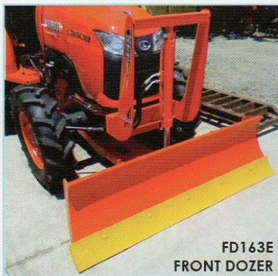
FD163E FRONT DOZER